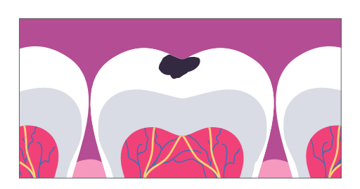
Decay in enamel